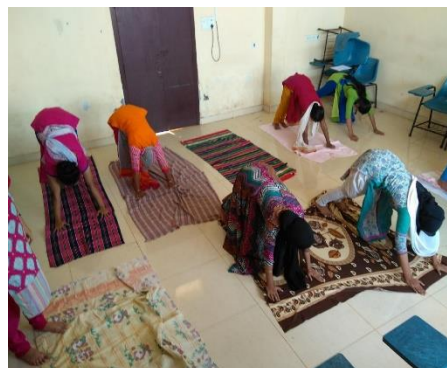
Photo from the training session