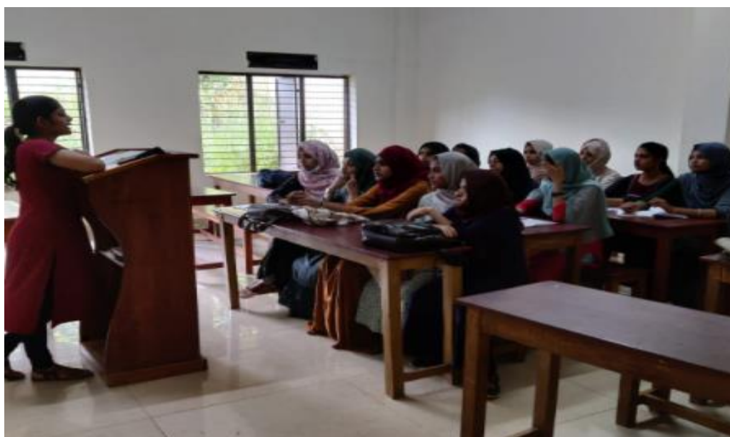
From the session