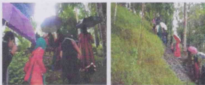
Distribution of pamphlet to Houses

They also distributed bleaching powder to keep their surrounding clean and also purify the ground water at their homes. This experience helped the students to be responsible citizens and also gave them the spirit of helping the society and spreading awareness to keep surroundings clean and also protect us from diseases.