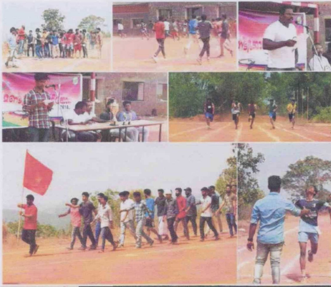
Photographs of the program

The annual sports function ' Mandikko Chadikko ' of our college was held in our college ground. A great interest was observed among the students. The students were lined up. There were several sports events such as high jump, long jump, pole vault, 100 meter race. The winners were awarded prizes by the chief guest.