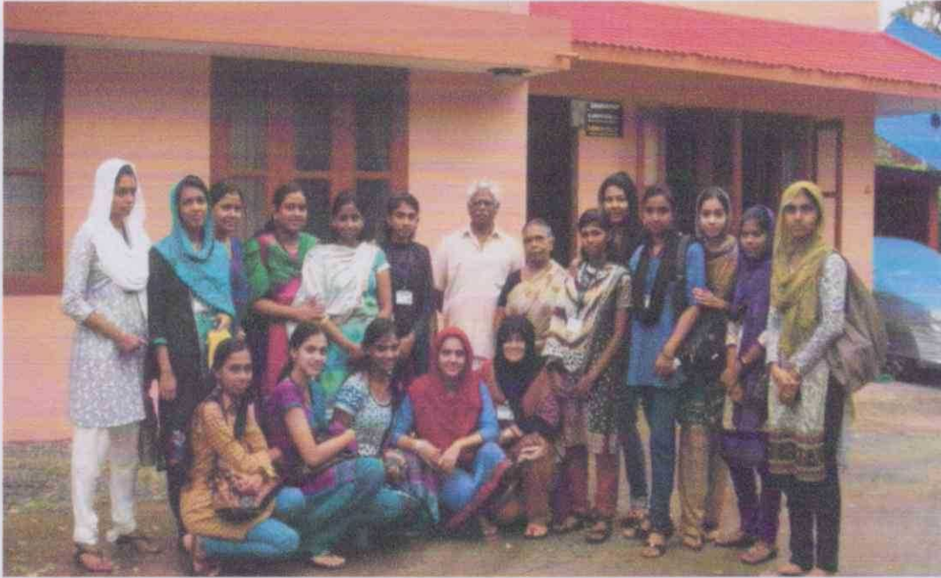
Awareness on Monsoon Diseases to families