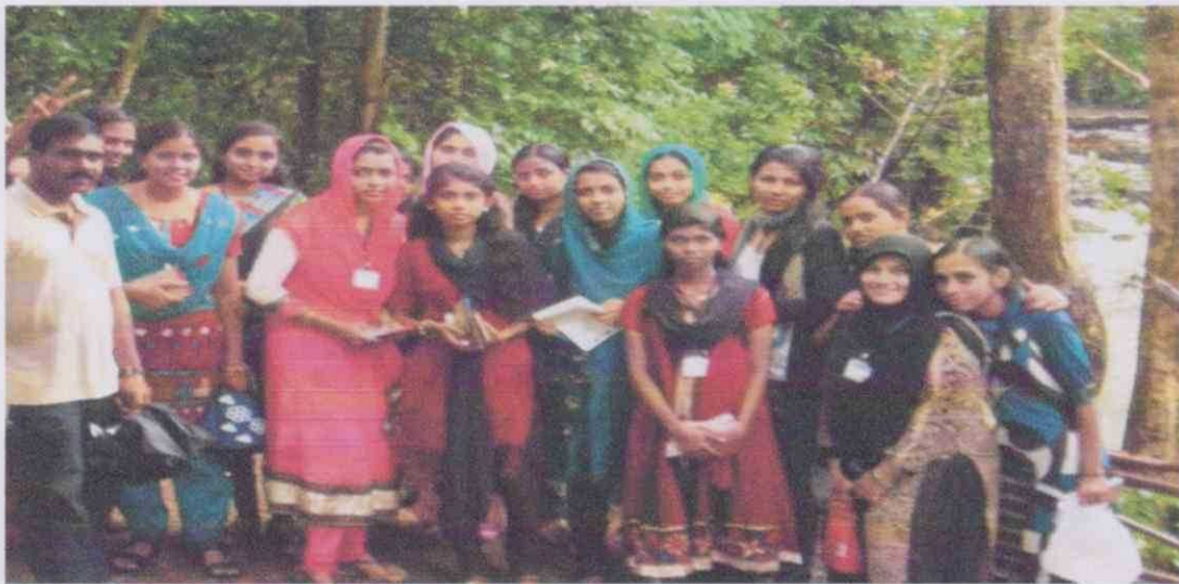
Bleaching Powder distribution

An ISO 9001 : 2015 Certified Institution