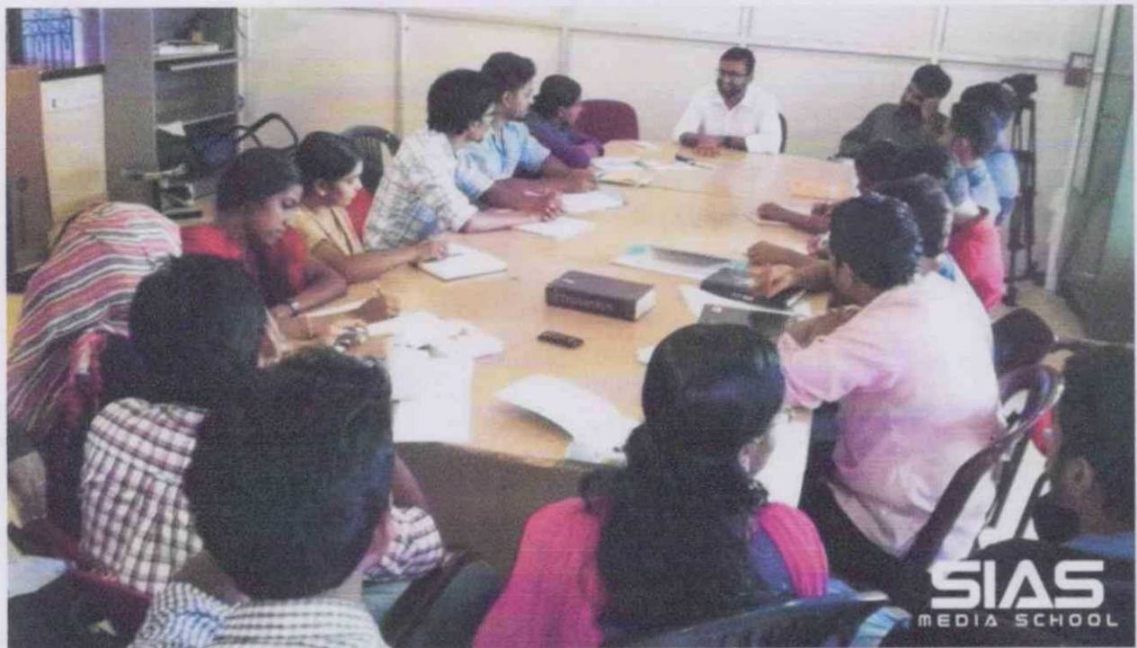
Photograph of the session

The Interns day celebration of MCJ department gave enlightening insight and inspiring information to students about social work and social action. The experiences from Kerala, Tamil Nadu, Maharashtra, West Bengal and Himachal Pradesh were like an all India trip through cultures, places and people. This memorable event was organized at a calm, pleasant venue- the newly built extension of the college canteen on August 12th 2017. Around 15 students along with other teaching faculties also participated in the program.